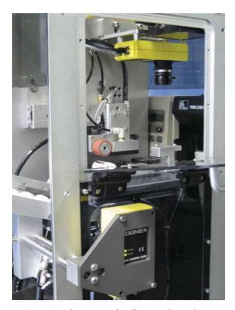
FIGURE 3. The ID reader (bottom) reads a barcode from an in-process label located on the cap and translates so that the vision system (above) can verify that the information is correct and readable before applying to the vial.

After the 2-D Data Matrix code is read and the label printed, the label is dispensed onto a "Touch & Go" Roller Grid from code-inmotion. Labels are dispensed sticky-side down onto these rollers, which are coated so that adhesive will not stick to them. After the label is printed, the printer digitally