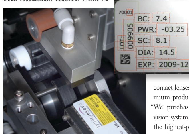
FIGURE 4. A roller system allows a label to be inspected before applied, sticky side down, without becoming stuck to the rollers, ensuring that the vial label will be correct (inset).

first started operating the systems, we continued with 100% manual inspection. But it soon became clear that no errors were being made. "We have operated two of code-in-motion's